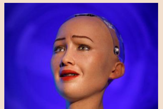
Sophia is the world's first AI Agony Aunt. With Absolutely zero experience, she has been advising executives for an impressive 3 days.