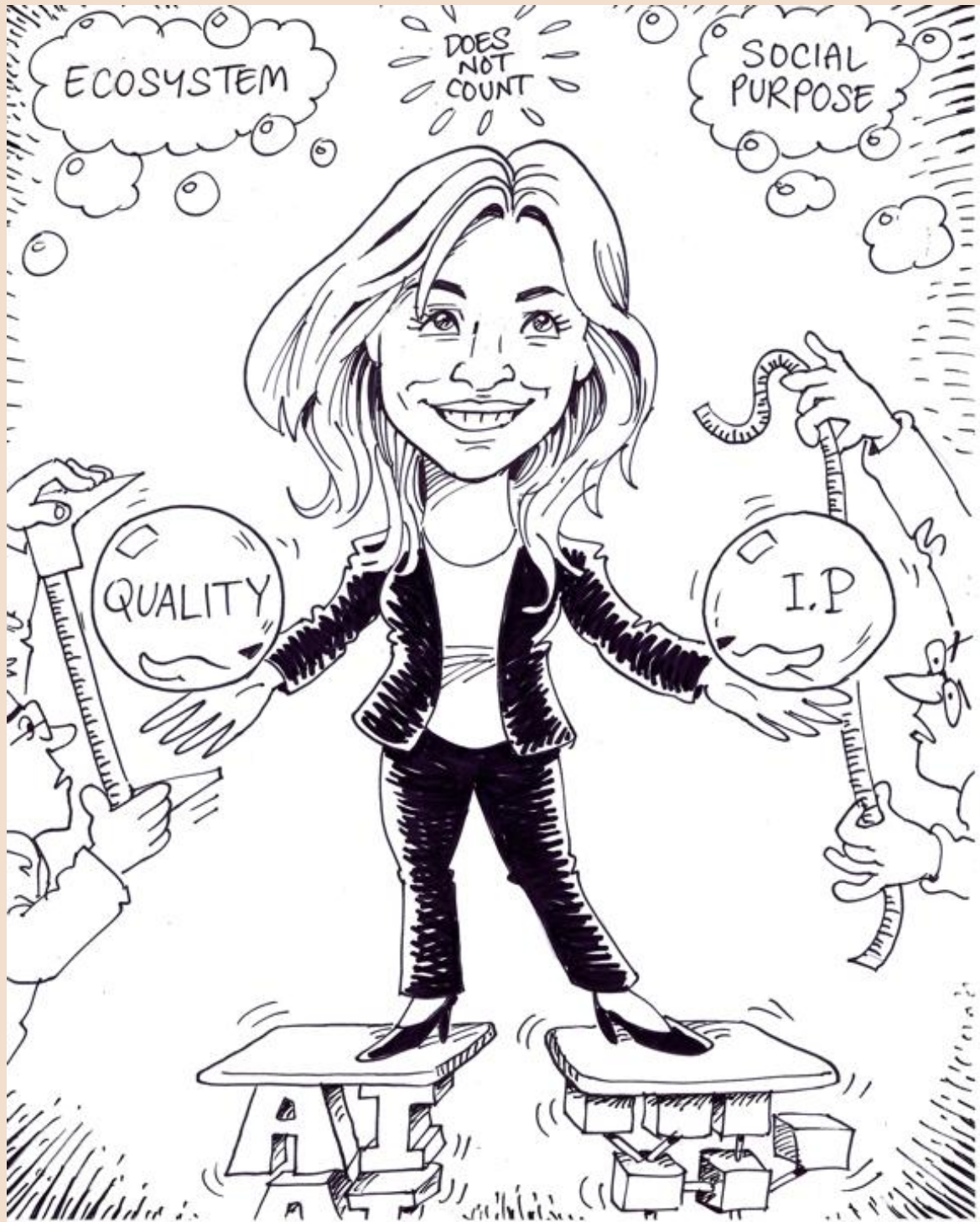
Missing person: CEO Big Innovation Centre gone fully intangible