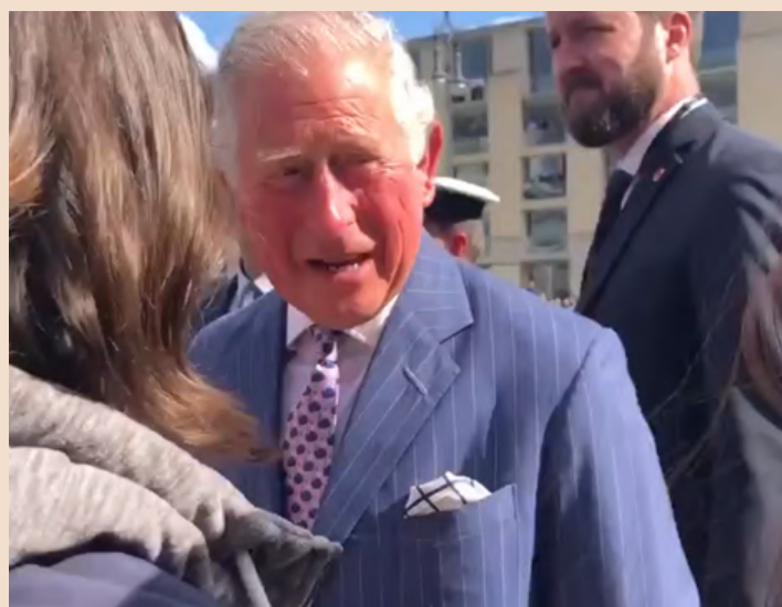
HRH the Prince of Wales seen in Berlin wearing a Pinstripe Royal Blue (blood) suit by Anderson & Sheppard (not on Savile Row)

The Prince initially sounded confused and tried to avoid the question replying, "Ehhh?"