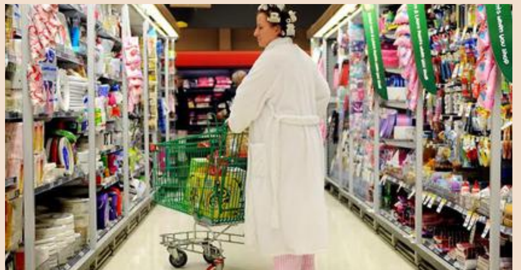
According to tech provider SterotypePlus, this type is not likely to vote in General Elections or EU elections

A spokesperson from the European Commission in Brussels has confirmed this will not be in violation with GDPR because the information is used to advise campaign managers only, and it would not change voter decisions. Plaid Cymru MPs expressed concern that information may not be as efficient to the party because of the time it takes to translate data to the Welsh language. In an attempt to explore how exactly shopper preferences could determine or at least be linked to voting preference, marketing manager from a leading supermarket who wanted to remain anonymous, told the Fake Times "We can see the value of the insights this brings to political parties, it is very similar to what we do when we decide how much to stock of each item on our shelves, all you have to do is look around. A predominantly jersey trousers and hoodie neighbourhood automatically means we need to stock up on booze and junk food, especially when they come for top-ups in the evening, we know exactly what they're in for".