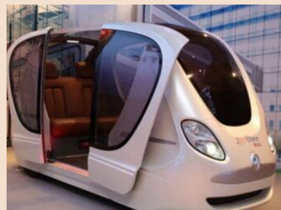
The Government will be investigating any Russian involvement in this unforeseen attack on democracy with measures already in place to ban the imports of Stolichnaya Vodka (although it's produced in Latvia)

"The whole point was to get rid of these old @@@@ and their silly demands and now we're stuck with automation being worse" complained a City Hall senior official who spoke on condition of anonymity.